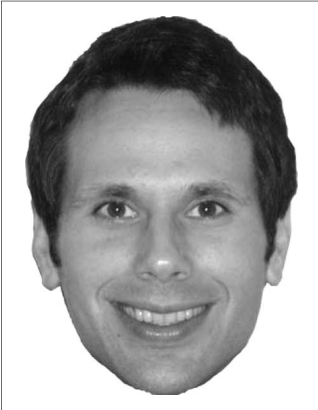
Figure 1. Sample stimulus of an American male volunteer prepared in the same fashion as those used in the actual experiments

Adams, & Macrae, 2008), men versus women showed no differences in their categorizations of the faces in any of the three cultures. Participants were not questioned about their own sexual orientations out of respect for cultural norms.